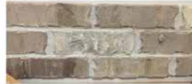
Brick: Mt Rushmore