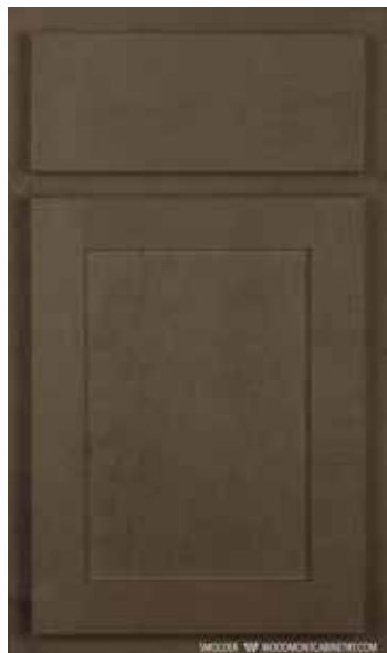
CABINETS - KITCHEN & BATH

200 KILBURN WILSON, NJ 07095 201-947-4400