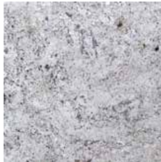
KITCHEN COUNTERS, B-SPLASH & FAUCET