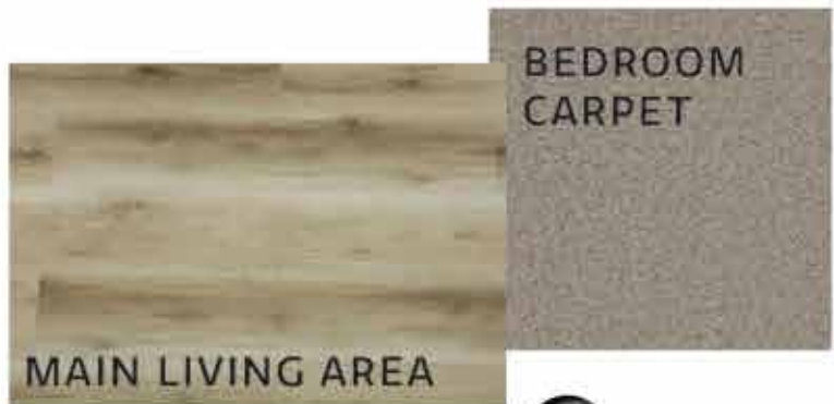
MAIN LIVING AREA